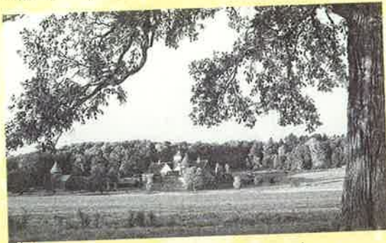
Shelburne Farms, a working farm, model of sustainable agriculture, and leader in schooling for sustainability.

Shelburne Farms, located seven miles south of Burlington on the shores of Lake Champlain, is a 1,400-acre working farm, a National Historic Landmark, and a national leader in schooling for sustainability. 17 Founded in 1886 as a model estate to demonstrate innovation in agriculture, the farm is managed today as an example of sustainable farming and forestry. Income from farm operations, catalog sales, and an inn and restaurant in historic buildings on the site is cycled back into education programs, which are more powerful for being rooted "in the reality of grazing cows, crafting cheese, tapping maples, sawing lumber, and planting seeds." 18